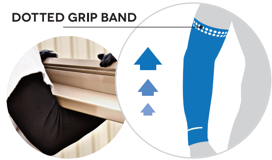
DOTTED GRIP BAND

No more slipping! Sleeves with arm openings featuring "STAYz-Up" technology hold up—comfortably gripping onto underlying fabric or skin to ensure sleeves stay in place, and keep you protected no matter what. Unlike other products on the market, we won't let you down.