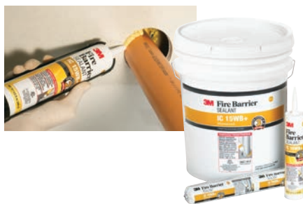
3M ™ Fire Barrier IC 15WB+ Caulk: Can be used to seal metallic, plastic and sprinkler pipes.

Recommended Solution: Provide a fast, cost-effective solution for firestopping plumbing pipes which penetrate wood frame and poured in place concrete construction. 3M ™ Fire Barrier IC 15WB+ Caulk, 3M ™ Fire Barrier Water Tight Sealant 3000 WT and 3M ™ Fire Barrier Ultra Plastic Pipe Devices are excellent product solutions when firestopping plumbing pipes in a variety of construction types. Refer to the proper UL tested and listed systems for complete firestopping details.