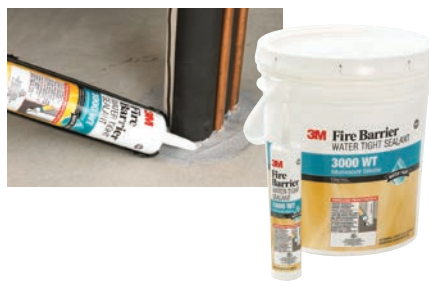
3M ™ Fire Barrier Water Tight Sealant 3000 WT: Can be used to seal metallic, plastic and insulated pipes.