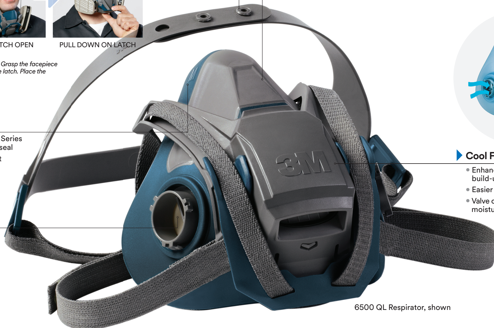
6500 QL Respirator, shown