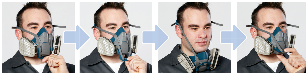
QUICK LATCH CLOSED PULL UP ON LATCH QUICK LATCH OPEN PULL DOWN ON LATCH

To open Quick Latch: Grasp the latch at chin level and pull up. To close Quick Latch: Grasp the facepiece with your thumb on the bottom of the facepiece and your first two fingers on top of the latch. Place the facepiece over your nose and mouth while pushing down on the latch.