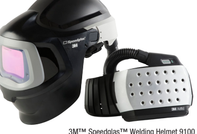
3M<sup>™</sup> Speedglas<sup>™</sup> Welding Helmet 9100 MP with 3M<sup>™</sup> Adflo<sup>™</sup> Powered Air Purifying Respirator