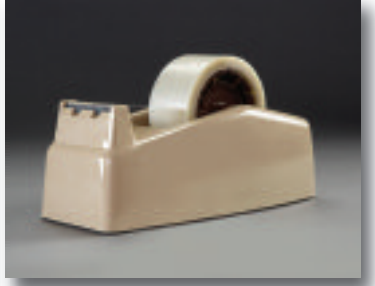
Scotch<sup>®</sup> Heavy-Duty Tabletop Dispenser C22 for pull and tear convenience.