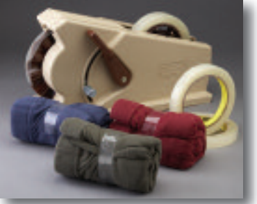
Scotch<sup>®</sup> Definite Length Dispenser M96 dispenses pre-set lengths of .75" to 5" per stroke.

Scotti <sup>®</sup> Wandar Dispenser S63 applies a neat, consistently sized L-clip of tape in a single pass of a box.