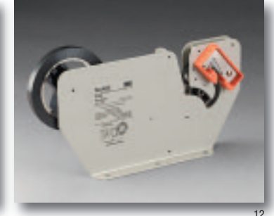
Scotch® Bag Sealer P400 applies tape in an adhesive-to-adhesive flag seal, includes bag trimmer.