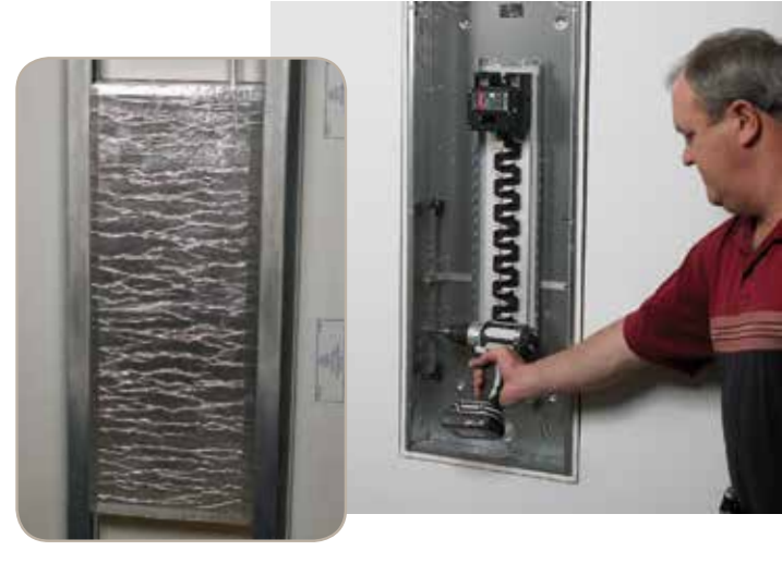
Approved for membrane penetration protection (e.g., electrical boxes and medical gas boxes).