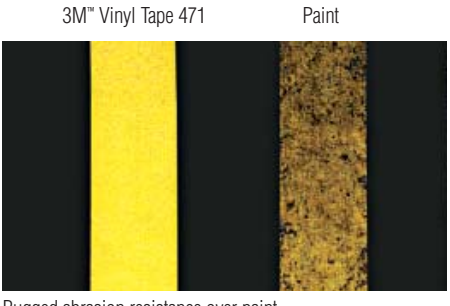
Rugged abrasion resistance over paint. Paint versus 3M™ Vinyl Tape 471.

MRO Markets Maintenance Repair Operations 3M.com/MRO Industrial 1-800-567-1639 Ext 4335 Electrical 1-800-245-3573