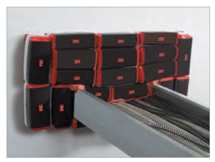
Fill, Void, and Cavity Material Classified by Underwriters Laboratories, Inc. ^{\circ} For Use In Through-Penetration Firestop Systems (XHEZ). See Current UL Fire Resistance Directory.