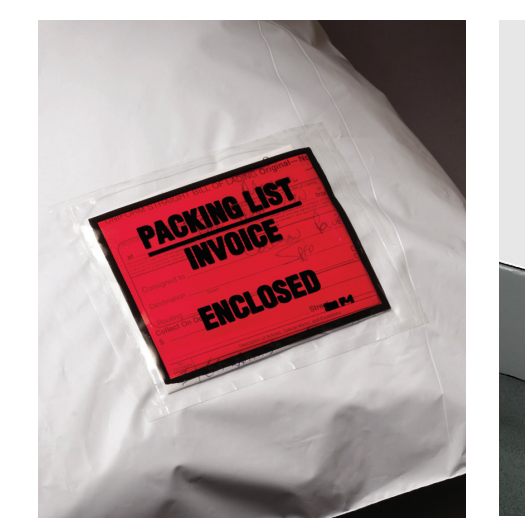
Secure adhesion — high tack, pressure sensitive adhesive on the back of the envelope grabs on contact and holds securely.