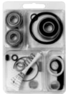
96236 – Motor Tune-Up Kit

Note: Please refer to page 4 of tool manual for specific part number.